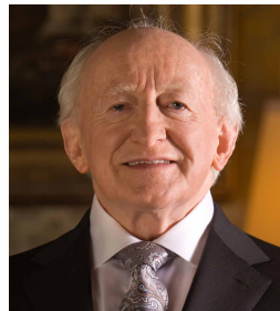
Michael D. Higgins Uachtarán na hÉireann President of Ireland