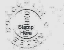
Sample Certification for a Safety Belt Installation