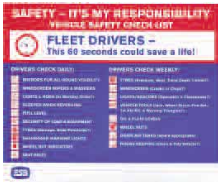
Daily driver check sticker

These measures put in place by the ESB to reduce vehicle-related injuries and deaths have achieved significant quantifiable results. This includes an 85% decrease in its annual insurance premium over a five-year period.