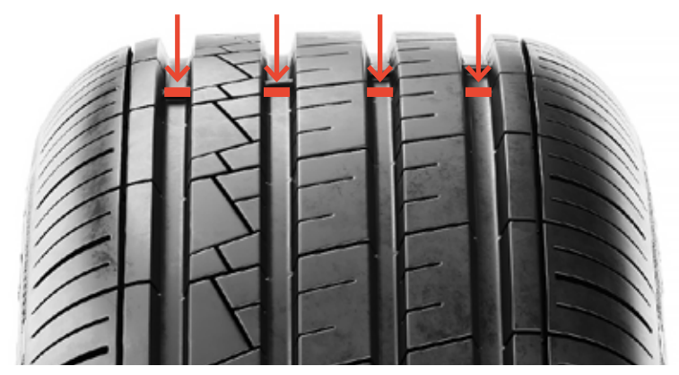
Figure 3: Tyre wear indicator

3. Tyres also have a 'tread wear indicator' block set into them at a depth of 1.6mm. You should check this block to ensure that this indicator is not at the same level as or lower than the tyre tread.