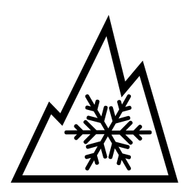
Figure 1: Alpine Symbol