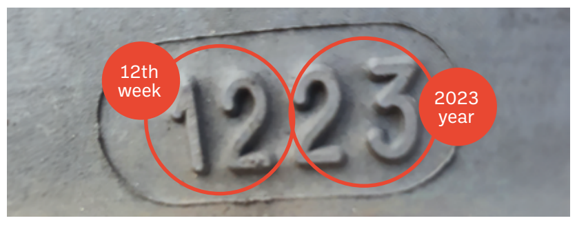
Figure 7: Production Date Code 1223 = 12th week of 2023

Tyres deteriorate with age. Signs of tyre aging include cracking or crazing (lots of fine cracks) on the side wall of the tyre caused by the tyre's flexing movements. The shape of the tyre tread can become distorted too. Tyre aging increases the risk of tyre failure. Tyres may begin to show the signs of aging from when they are six years old.