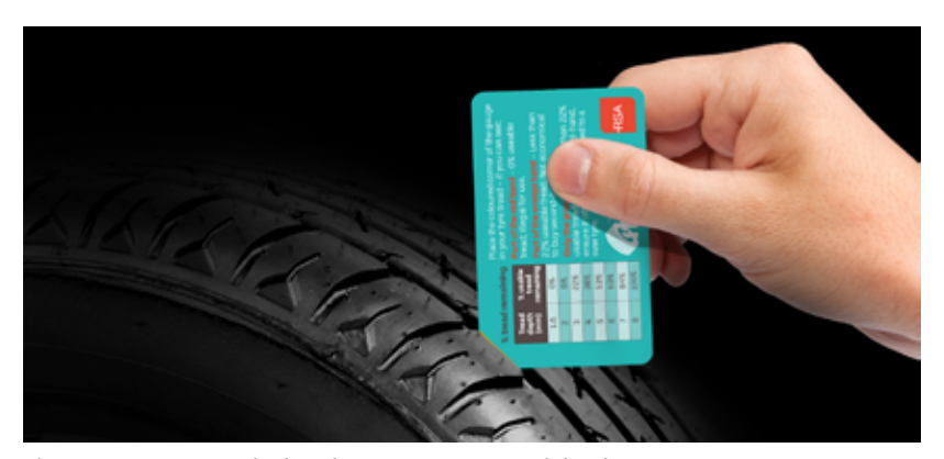
Figure 5: How to use the handy pop-out tyre tread depth gauge.

4. Ask the seller if the tyre has undergone a condition check (including when it is inflated) to make sure it meets the minimum legal requirements and is free from defects both internally and externally. Common defects include tears, lumps and bulges. A tyre that is not roadworthy will result in a car failing its NCT as well as reducing your safety on the road. Examples of particular tyre defects are shown below.