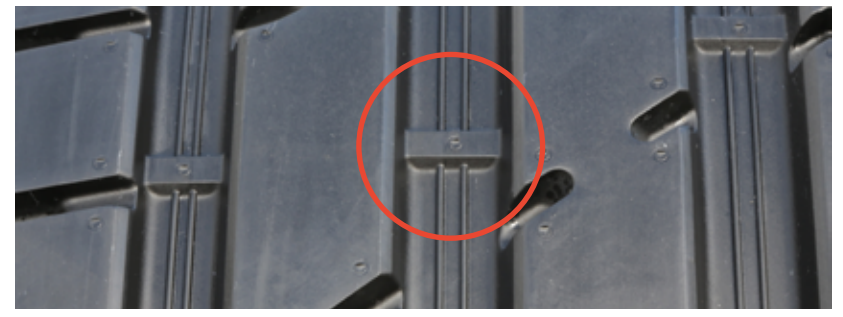
Figure 4: Tread Wear Indicator block