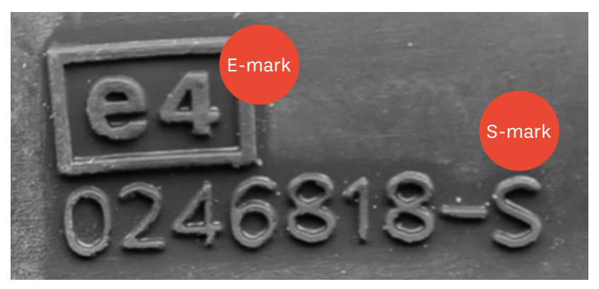
Figure 2: E-Mark and S-Mark on tyre sidewall

An E-mark on a tyre confirms that it meets minimum EU or International (UNECE) standards in relation to its size, load and speed rating. E-mark tyres have been tested to ensure they have adequate tread depth and performance ability. The E-mark consists of an 'E' or 'e' and a number within a circle or a rectangle.