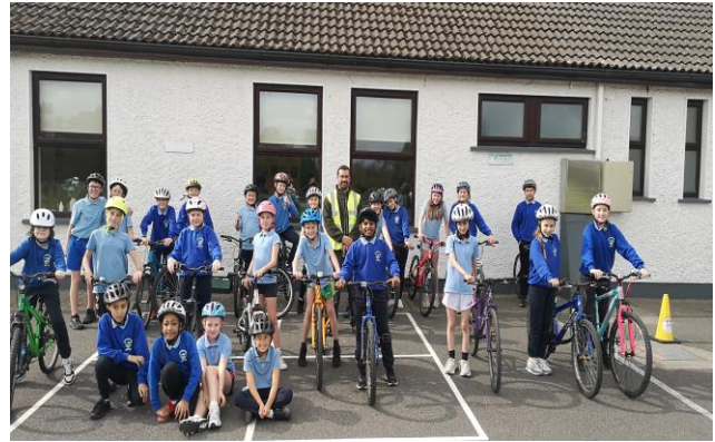
Photo: Pupils carrying out the Cycle Training Course at Claregalway National School – Sept. 2025