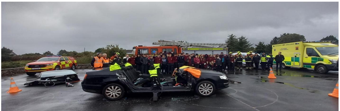
Photo: Fire Service Demo held at Coláiste Cholmcille, Indreabhán, in Oct. 2024