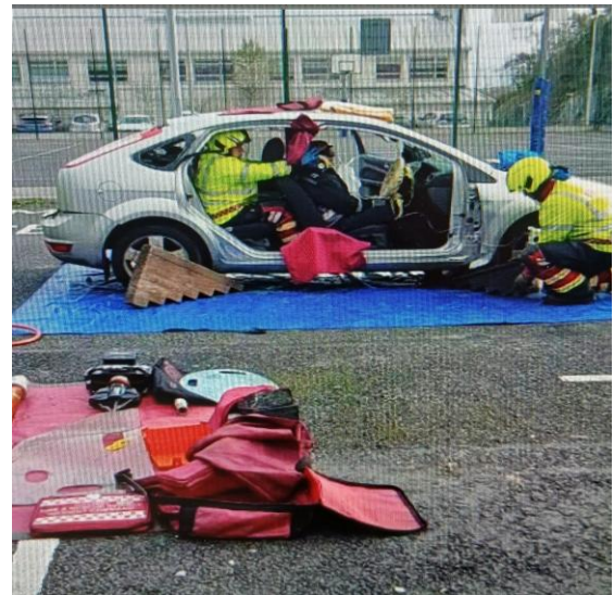
Photo: Fire Service Demo held at Clifden Community School in Oct. 2024