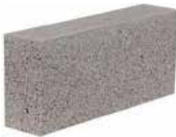
100 x 220 x 450 mm solid concrete building block

In order to meet the real total mass requirement, irrespective of the unladen weight of the trailer, you are required to place 30 four-inch (100 x 220 x 450 mm) solid concrete building blocks in the trailer. If it is accepted that a trailer will weigh a minimum of 250 kg on its own, the 30 blocks (each weighing approximately 19-20 kg) will weigh an additional