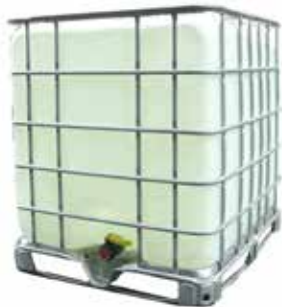
Example of an IBC

Loading of the vehicle can be achieved by placing containers known as IBCs (intermediate bulk containers) on the vehicle. IBCs have a stated capacity and so are ideal as proof of a given weight. For example, a 1,000 litre IBC when filled with water will weigh 1,000 kg (1 tonne). IBCs are also available in lesser capacities. It is also advised to fill the IBC to the top with water to avoid liquid movement, as would happen if only partially full.