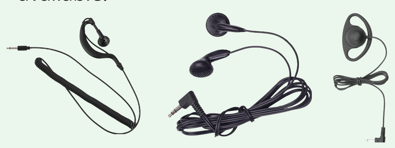
Examples of RSA compatible in-helmet earpieces

If you do not have a suitable earpiece already your local electronic store or phone accessory shop should have suitable ones available.